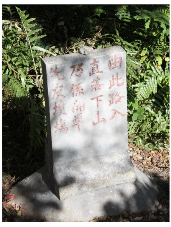
Direction Stone, Phosphate Hill

However, despite such progress, recent events have left Christmas Islanders once again asking what the future holds for them and for the indelible Chinese heritage footprint they have worked so hard to preserve.